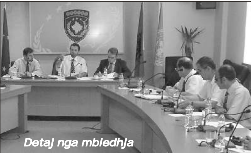
Detaj nga mbledhja

Further functioning of this council should be orientated in the direction of new principles of Convention on the Rights of Persons with Disabilities and give a real dimension for preparation of conditions to be implemented in Kosovo.