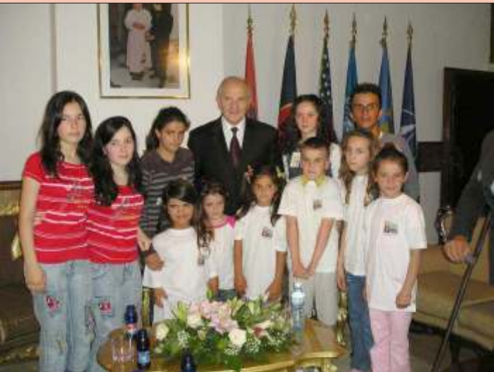
President Dr. Fatmir Sejdiu with children Ambassadors

In Mitrovica, Peja, Ferizaj, Children Ambassadors met presidents of their municipalities and after holding children's assembly; they forwarded messages to the President of Kosovo. This was a good opportunity for children to get some more information about their